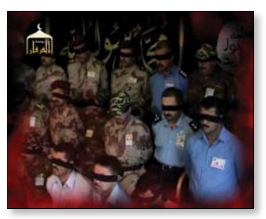
Figure 96. Employees of the Interior and Defense ministries kidnapped (and later executed) by ISI/AI-Qaeda

The site also advertised a new film, dated April 20, titled The Confessions Of 20 Men Affiliated With The Interior And Defense Ministries. Produced by AI-Furqan , the six-minute film shows 20 men, all in uniform with IDs affixed to their chests, "confessing" to employment in the ministries of defense and the interior (see Figure 96). A voiceover explains that ISI/AI-