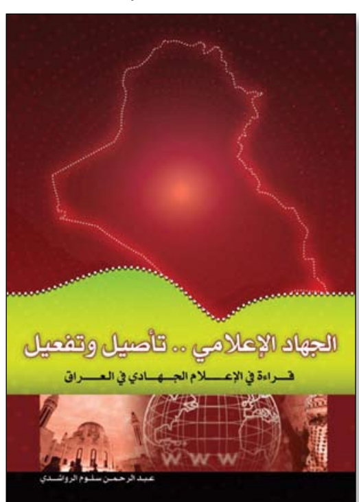
Figure 94. The cover of a 221-page sympathetic study of "jihadist media in Iraq" released by Wikalat Haq

The continuing stream of increasingly sophisticated media products distributed through failsafe Internet-based delivery channels comes as confirmation that insurgents are more aware than ever that they are engaged in a battle not just of bullets and bombs, but also a war of images and ideas. With Sunni insurgents fully conscious of the importance of media, and clearly skilled in the creation and