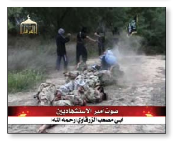
Figure 97. The execution of Interior and Defense Ministry employees by ISI/AI-Qaeda; note the cameraman at the executioner's side