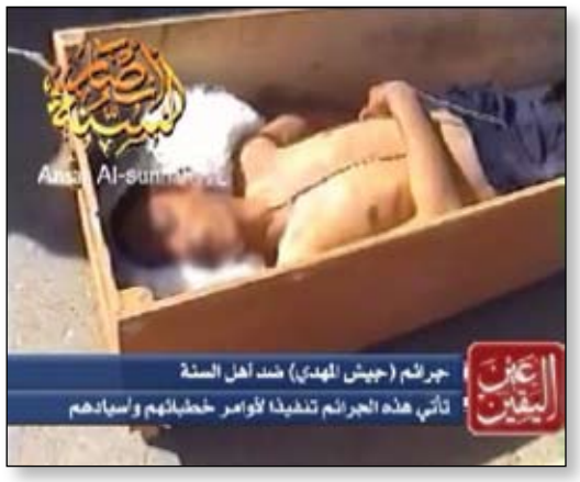
Figure 95. Excerpts from a film by Ansar al-Sunnah, a Sunni insurgent group, showing an address by a radical Shi'ite cleric and photographs of Sunnis allegedly killed by Shi'ite death squads; the caption reads "The crimes of the Mahdi Army against Sunnis—these crimes are committed on the orders of their preachers and leaders"